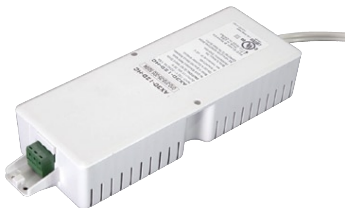
DC Output Connector